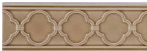
Vendome Border 3\frac{1}{4}" \times 10\frac{1}{8}"