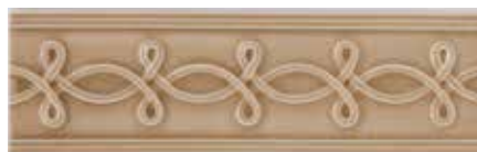
Rivoli Border 2\frac{5}{8}" \times 8\frac{3}{4}"