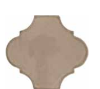
Arabesque Field 6" \times 5\frac{1}{2}"

The Tuileries Collection offers a fresh take on classic French motifs, splendidly reborn in carefully edited decorative patterns, perfectly suited for today's refined interpretation of traditional style. The collection's name is inspired by the Jardin de Tuileries, which is the "central park" of Paris. "Tuile" means tile in French, and this historic park started its life as a clay quarry and tile workshop in the early 13th century. What could be a more fitting name for a collection that celebrates the heritage of French handmade tile and design?