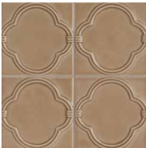
Vendome Deco Field 5" x 5"