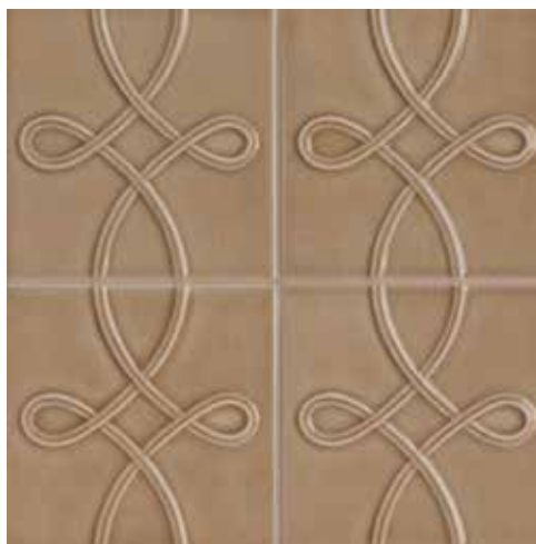
Rivoli Deco Field 5" x 5"