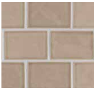
Brique Mosaic 2" x 3"