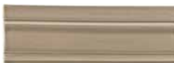
Rail Molding 2\frac{5}{8}" \times 7\frac{1}{2}"