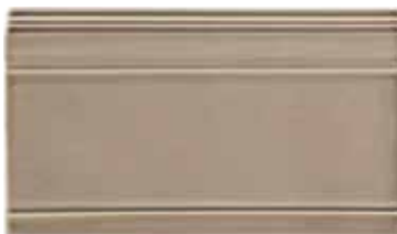
Base Molding 4\frac{3}{8}" \times 7\frac{1}{2}"