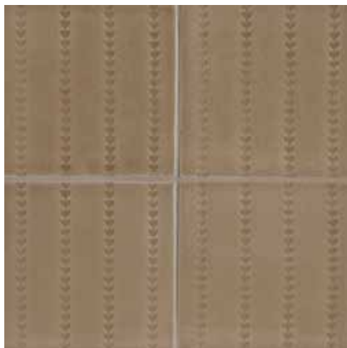
Madeline Deco Field 5" x 5"