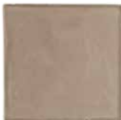
Field 5" x 5"